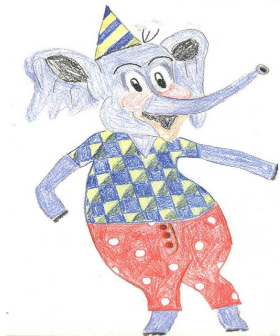
Fig. 4 – The elephant from a cartoon (free association).

The global functional assessment (GAF) scale was applied to measures psychological, social and occupational functioning 12 . Clinical assessment was performed and GAF score showed moderate symptoms on admission and mild on discharge (56 vs 68, respectively). The Beck's Depression Inventory (BDI) was used for self-rating depression and the reduction of the BDI score from 18 to 6 during the treatment course was recorded 13 .