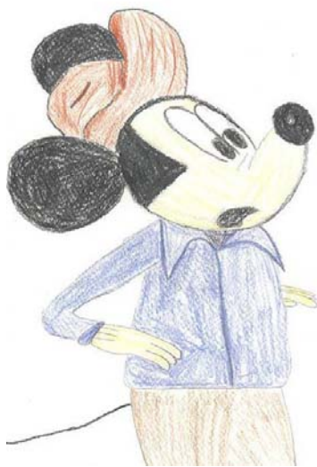
Fig. 3 – The childhood memories of Mickey Mouse.

He was surprised because he thought his drawing childless and felt ashamed. He had no idea what to draw at the beginning of the session, than he recalled that he liked to draw popular heroes of cartoons, and spontaneously, according his childhood memories drew Mickey Mouse. The members who voted for his drawing told that he made them very chilly and turned them to their happy childhood. They stressed that his drawings were made by great skills. He was very glad and next sessions he continued to draw other cartoon hero (Figure 4) and got many voices from the others and reported that he had already gotten most gratification from his son. He started drawing Mickey Mouse and other cartoon heroes at home. His son liked to watch him during drawing and tried