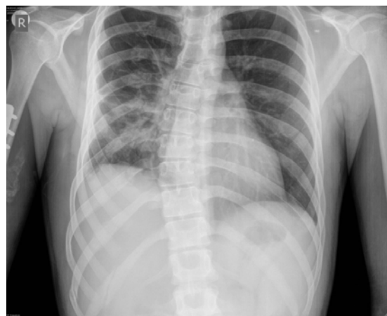
Fig. 5 – Complete reexpansion of the lung in the presence of contusion lesions.

(DCP) osteosynthesis of 8 holes was performed and cortical screws were placed with deliberation radial nerve (Figure 6).