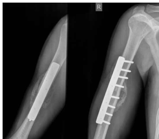
Fig. 6 – Humerus after plate osteosynthesis of 8 holes and cortical screws.

On the 26th day of hospitalization the treatment of the patient included the physical therapy and electrostimulation for radial nerve lesions verified before the osteosynthesis. On the 27th day of hospitalization, the patient was removed from mechanical ventilation. Tracheal cannula was removed, too. Tracheostoma was healing per secundam . The patient was taken to the Department of Thoracic Surgery for further observation, after a 30-day-stay in the Intensive Care Unit (ICU). Radiographic examinations of the chest registered rib fractures repairs and almost complete regression of lesions was in the lung parenchyma was found. Arterial blood gas analysis during spontaneous breathing: PaO 2 :12.3 kPa; PaCO 2 5.8 kPa; HCO 3 – 23 mmol/L. Control CT scan performed on the 23rd day after the removing liver packs showed normal findings (Figure 7). We continued with physical therapy that led to regression of lesions of radial nerve. At discharge, neurological status of the patient's right hand – inability to dorsiflex the hand and inability to abduct the thumb. Thirty five days after the hospital treatment, the patient was discharged and recommended to continue to attend the rehabilitation programme.