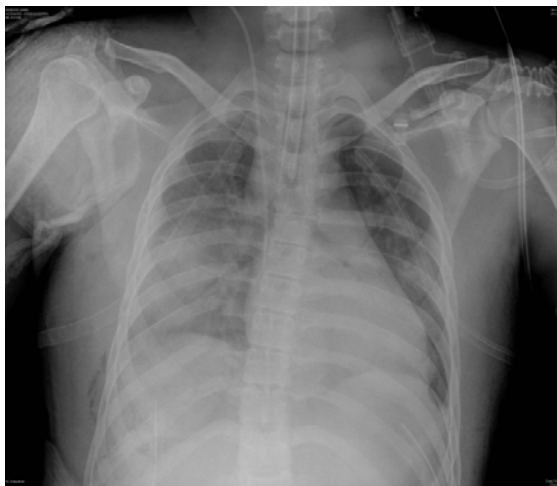
Fig. 4 – Drainage of both pleural cavities due to right sided hemothorax and left sided pneumothorax.