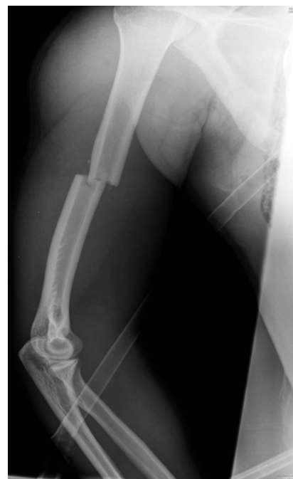
Fig. 3 – Fracture of the right humerus.