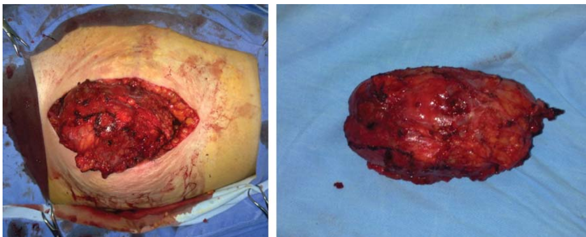
Fig. 2 – Intraoperative findings: large encapsulated tumor of the right thigh with clean resection margins.