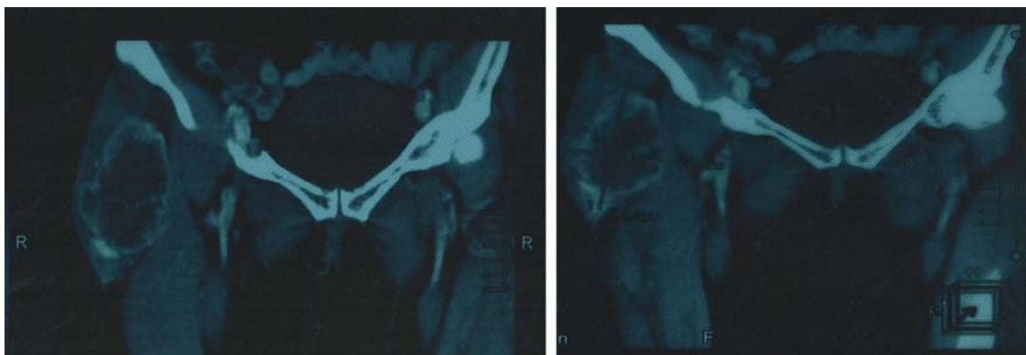
Fig. 1 – Computed tomography (CT) examination of the right femoral region shows an expansive heterodense tumor mass within musculus tensorfascialatae , internally in the tumor larger zone of necrosis can be seen.

Operating material was sent for histopathologic analysis. Grossly, the tumor at the intersection was of whitish color, vitreous luster, with yellowish areas of necrosis and hemorrhage. Tumor samples were fixed in formalin, embedded in paraffin, cut into the cryotome in 4 μ thick tissue sections and stained with standard hematoxylin and eosine (HE) staining method. Microscopically, the tumor showed a classic image of a giant cell type MFH. It was built out from