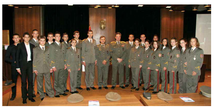
First class of cadets enrolled in 2009

In such a professional and scientific surrounding, logical continuation in the development of the MMA is an investment in the future of Serbian military healthcare, which commenced in 2009. That was the year when the first class of cadets enrolled in the College of MMA. The license for work was obtained by the Ministry of Education of the Republic of Serbia. In 2015, the first class of medical doctors finished their Integrated Academic Studies and were promoted to medical officers of the Serbian Armed Forces. The Faculty was registered in 2013 by the Board for