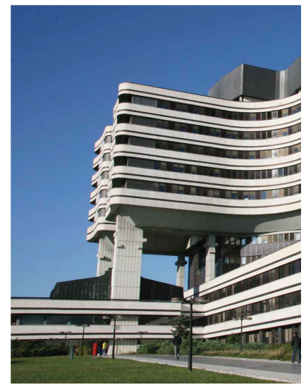
Military Medical Academy - new building