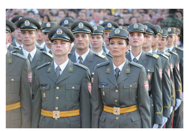
Promotion of the first class of cadets

Accreditation of Scientific Research Institutions. In 2020, as an accredited scientific and research institution, the Faculty signed an agreement with the Ministry of Science, Technological Development, and Innovations of the Republic of Serbia. Although researchers from the Faculty were previously engaged as co-workers in various projects funded by this Ministry, in 2024, the Faculty was a carrier of such project for the first time.