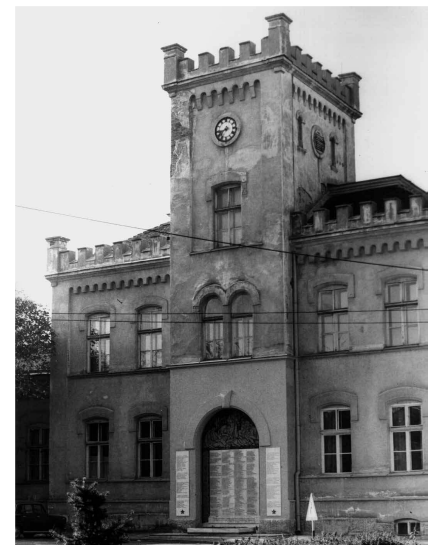
Military Medical Academy - old building

With a 180-year-old tradition, MMA is one of the oldest medical and scientific institutions in the Balkans and Southeast Europe. The First Central Military Hospital of the Serbian Armed Forces was established in 1844 by the order